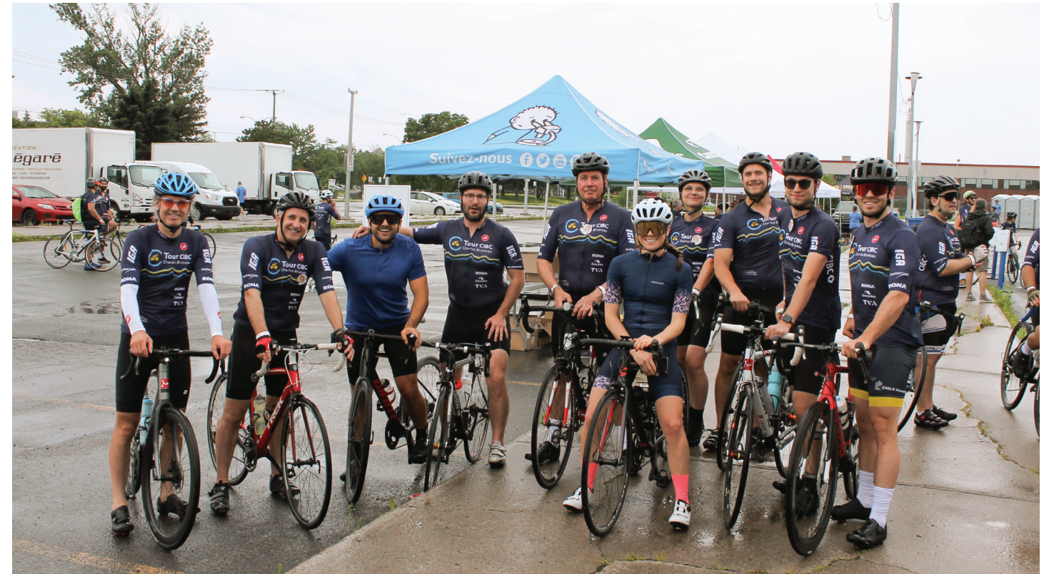
BTB Cycling Crew at the Charles-Bruneau Foundation's Tour CIBC, July 2023

In 2023, 50% of BTB managers were women. We will maintain a minimum of 50% women in management roles going forward. Furthermore, 33% of our Board of Trustees are women.