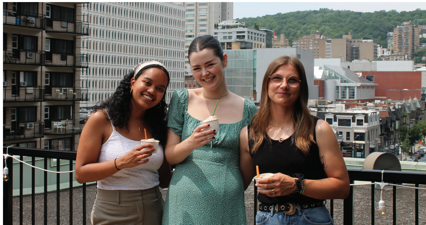
Employee planting workshop and lunch, Montréal office, July 2023

In 2023, we conducted ESG training to build organizational capacity and knowledge around sustainability integration and best practices in real estate. The training was made available to executives and employees for whom sustainability is part of their roles and responsibilities. We also provide training related to social aspects of ESG to all employees, such as mental health training. Furthermore, we have a manager leadership coaching program to equip our managers with the leadership skills needed to support their teams and contribute to their career advancement at BTB. The program helps build strong relationships between employees and their supervisors. In 2023, 43% of our managers received leadership coaching as part of the program.