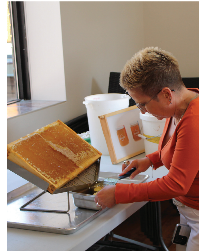
Honey extraction workshop with Alvéole, Montréal office, August 2023