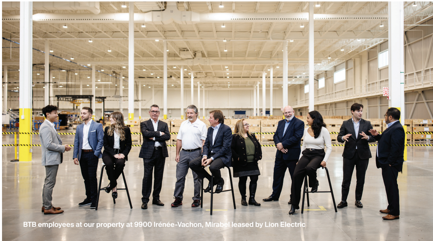
BTB employees at our property at 9900 Irénée-Vachon, Mirabel leased by Lion Electric

We invest in industrial, off-downtown core office and necessity-based retail properties for the benefit of our investors. BTB’s investment strategy focuses on primary markets, our clients’ reputation, long-term vision and redevelopment opportunities. BTB is listed on the Toronto Stock Exchange (TSX).