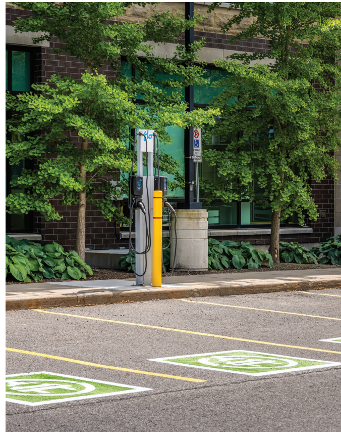
EV charging stations installed in 2023 2611 Queensview Drive, Ottawa, ON