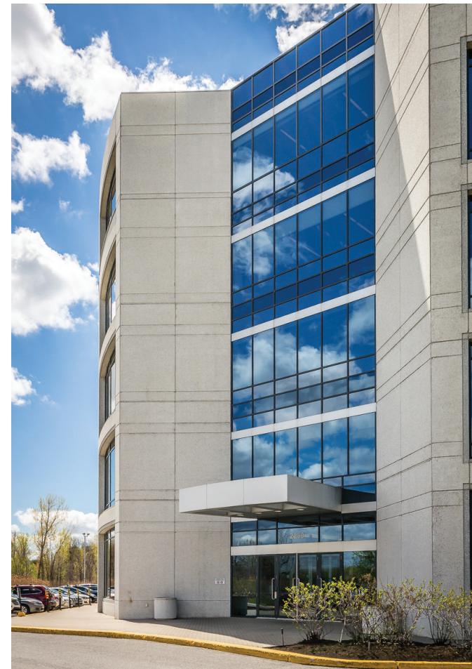
LED lighting retrofit in 2022 2250 Alfred-Nobel, St-Laurent, QC